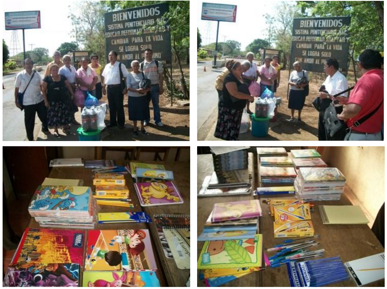
Notebooks, Pencil that was delivered to the brothers in the Prison the day of the visit